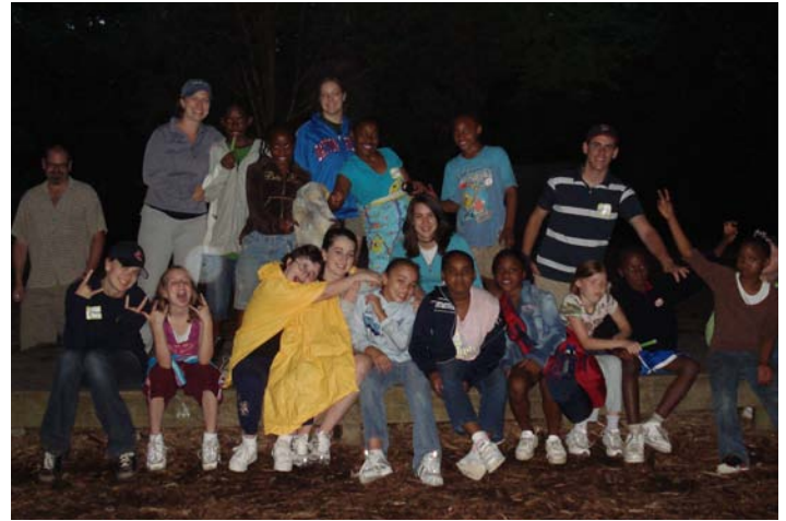
Roots and Shoots members joined Kiser Elementary students on an overnight nature immersion camp at Glen Helen Nature Preserve, Yellow Springs, Ohio.