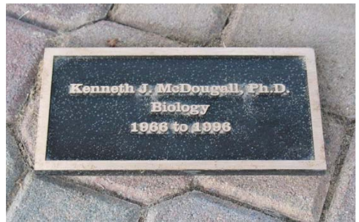
Memorial bench plaque.